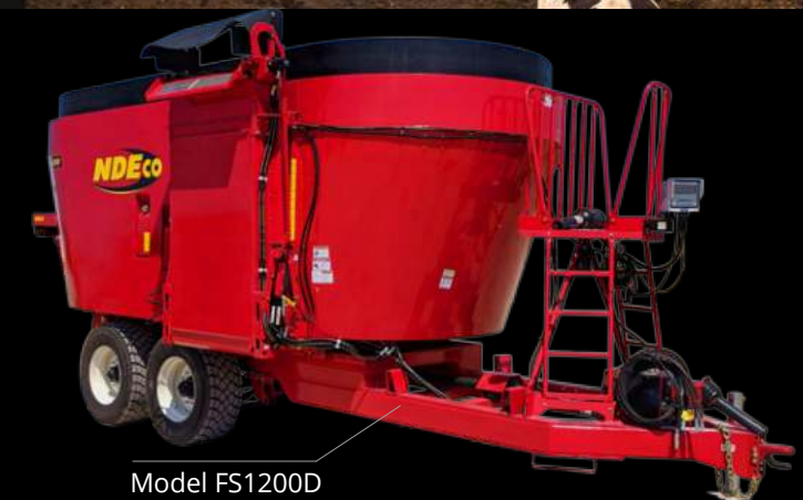
Model FS1200D (with 7.5' side conveyor)