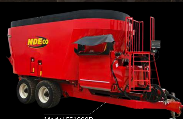
Model FS1000D (with RH front dog leg conveyor) (with Super Single tire option)