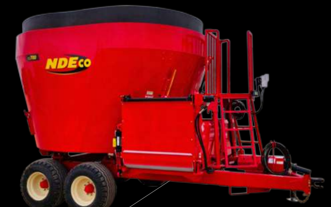
Model FS700 (with front dogleg conveyor)