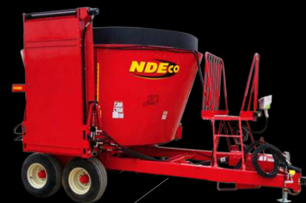
Model FS500L (with 7' side conveyor)