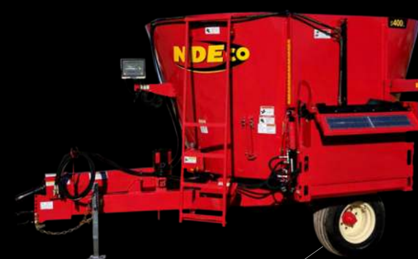
Model S400L (with 3' conveyor)