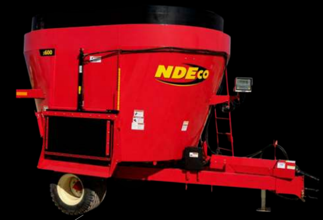
Model S600 (with chute)